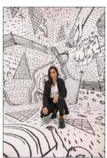
New mural at Liberty Station by artist Panca SEE PAGE 13