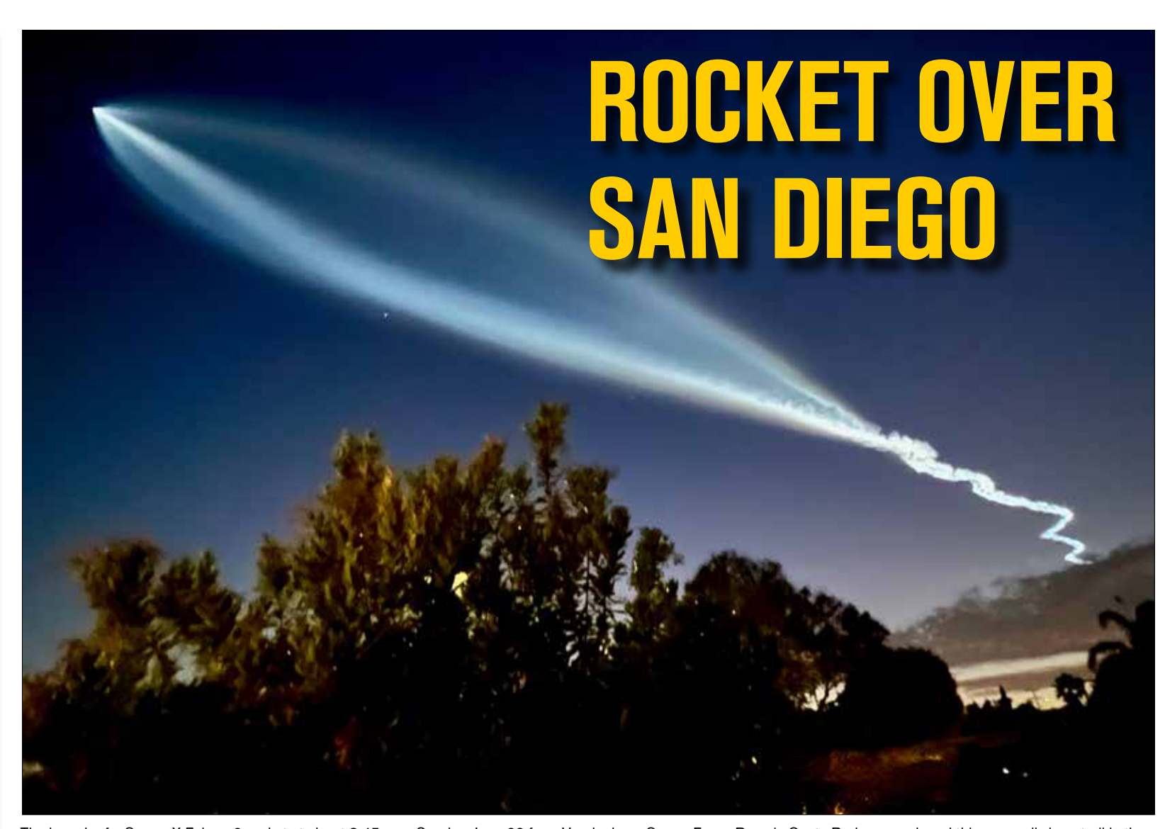
The launch of a Space X Falcon 9 rocket at about 8:45 p.m. Sunday, June 23 from Vandenburg Space Force Base in Santa Barbara produced this unusually long trail in the skies over San Diego as it headed in a southerly direction before disappearing from view. The rocket carried 20 Starlink satellites including 13 with Direct to Cell capabilities to low-Earth orbit. Peninsula Beacon photographer Scott Hopkins captured this image of the rocket's trail from his home using an iPhone 13 Proax. Exposure was 18 mm. for 1/4 second at f/1.8 handheld.