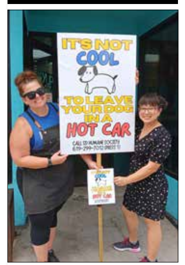
OB businesses promote 'Hot Dog' campaign SEE PAGE 6