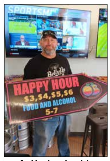
Acai bowls and paninis at remodeled We Be OB SEE PAGE 5