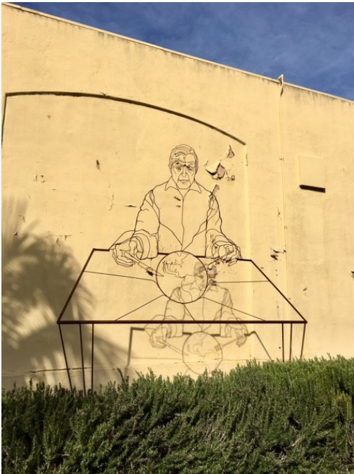
2017 - Spencer Little Plastic Dinner - Wire