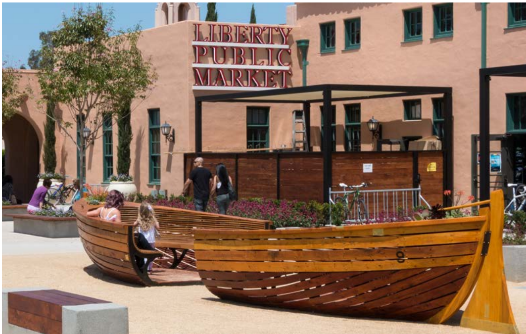
2016 - Jonathan Allen USS Brave - wood and lights