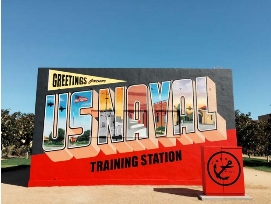
2016- Victor Ving Greetings -mural