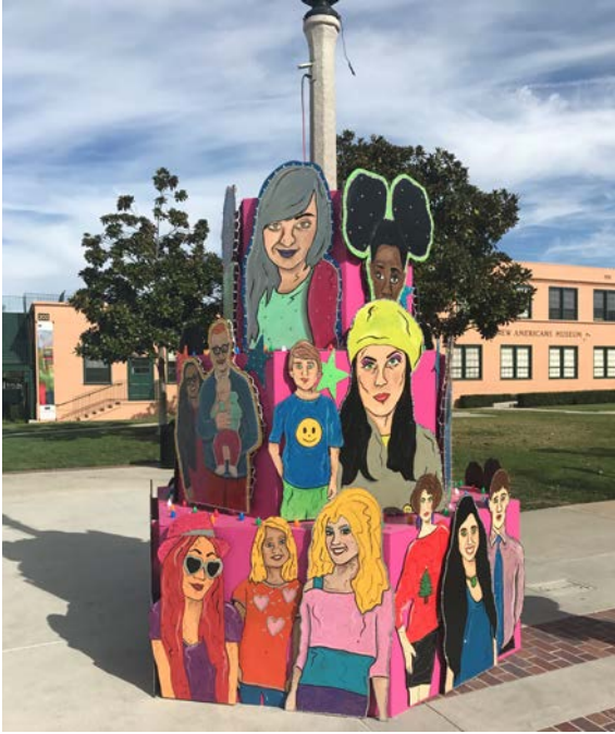
2016 - Ben Cabral Some Faces from Around Here - wood, LED lights, paint