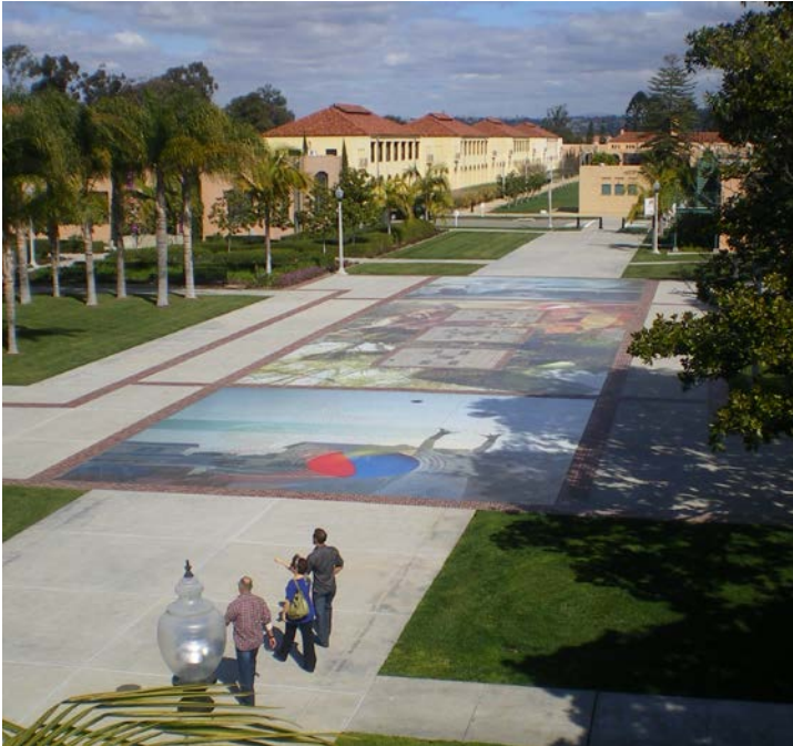
2009 - Shinpei Takeda Under+Stand (w/The AJA Project) - Vinyl Adhesives