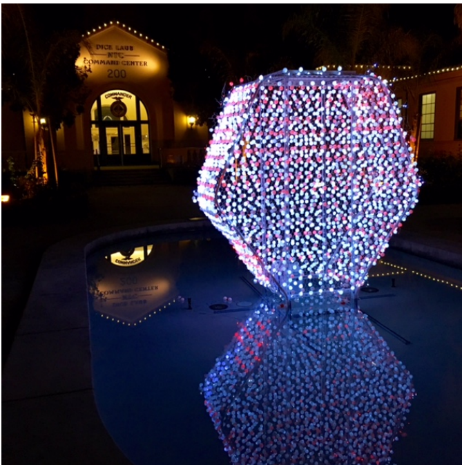
2015 - Smadar Samson ICE - wire, LED lights, pvc